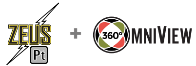
OmniView360° Camera, TruView de-curved Image*