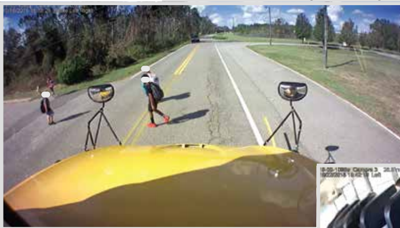
ShieldCam™, Forward-facing Camera Image*